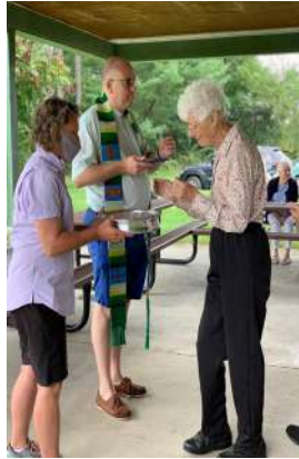
fellowship, fun & food!

We will continue our seminarian celebration with a festive coffee hour immediately following the special service. If interested in helping with the party or providing a tasty treat or ready-to-serve item for the festivities, that would be most helpful. Let's make this an extra special day for them! They both deserve our thanks and praise - we've been blessed to have them here at Clarke Parish.